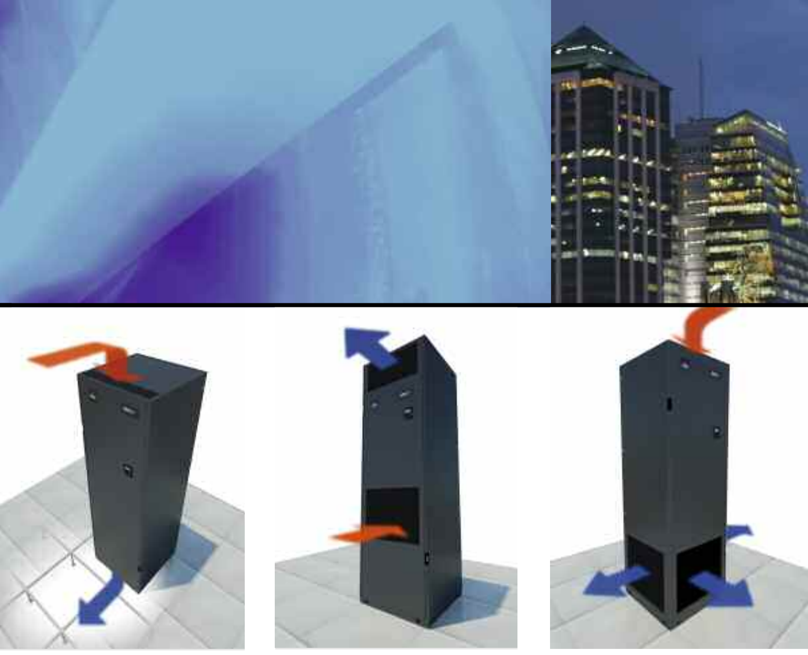
under floor air delivery