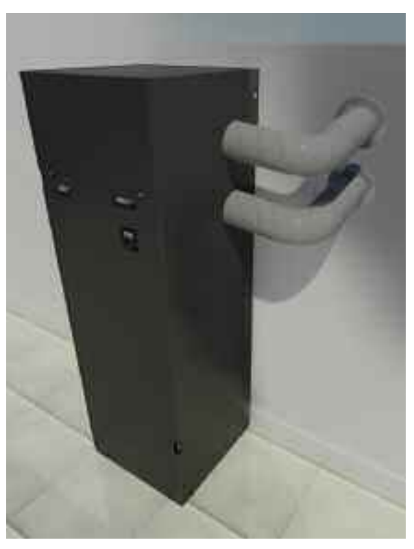
lateral outdoor air connection