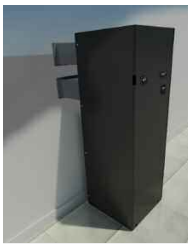
back outdoor air connections